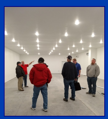
Old Threshers Board members look at the progress of the new doll and clothing museum located in Museum A.

Access Energy and Mt. Pleasant Utilities are in the process of making electrical upgrades in the campgound along K and P rows.