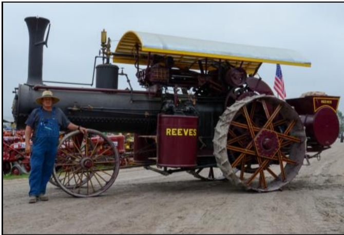
1915 20HP Reeves Owned by: Duane & Lana Wood Wallace, NE