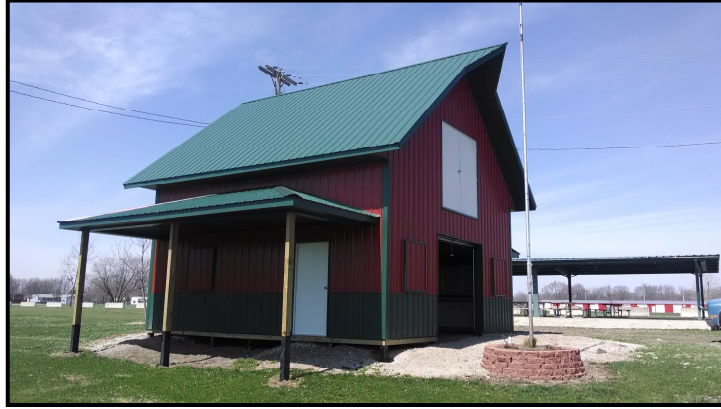
The new Traction Steam Headquarters Building is almost done.

Built by Weiler Construction, it matches the other buildings on the grounds following the red and green color scheme.