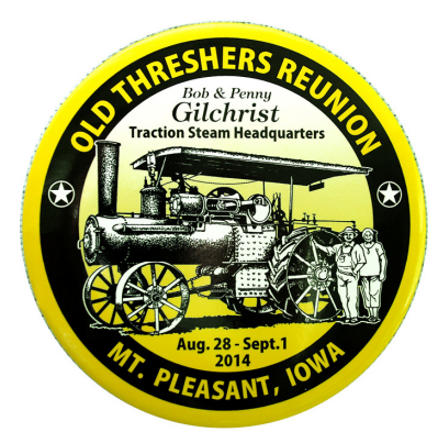
2014 Button Collectors Forum