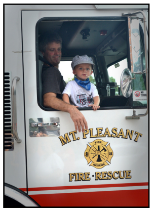
People of the Old Threshers Reunion