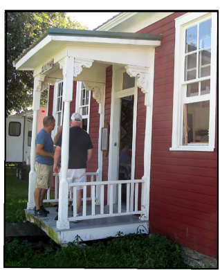
\sim A Time for Fellowship and Discovery \sim